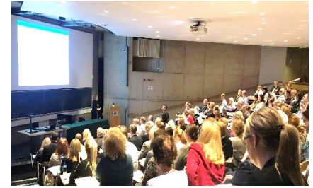
Dublin Town Hall Presentation at Trinity College

A copy of the town hall presentations is available on the website by clicking here . Thank you to participants who provided feedback subsequently.